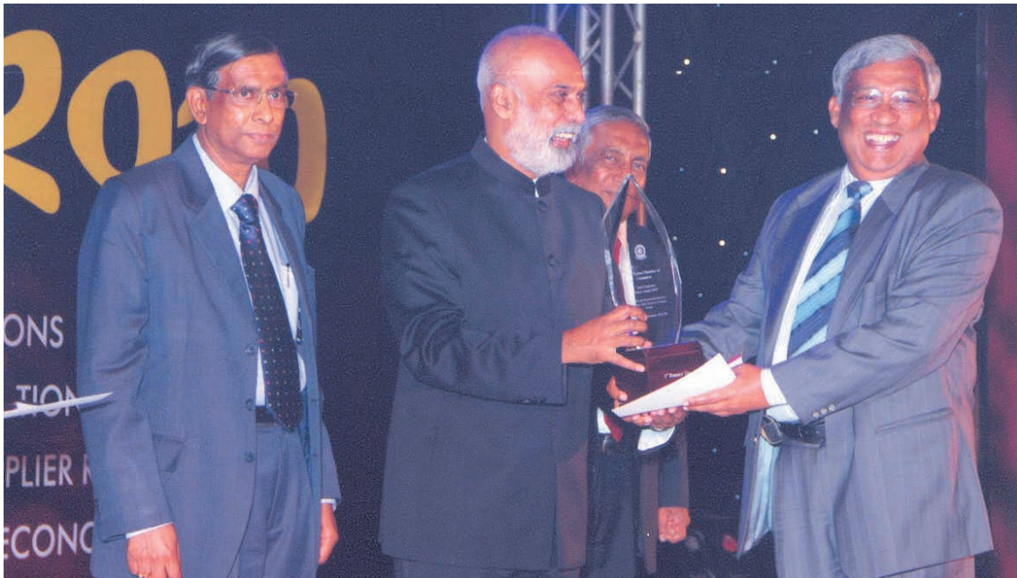
Chairman, Link Natural Products receiving the Award