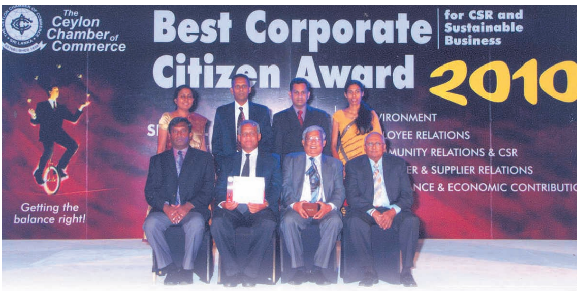
Senior Staff from Link Natural Products

In recognition of its activities towards the country and society, Link Natural Products clinched the Best Corporate Citizens Award for 2010 for its commitment to improving the educational facilities in schools in the Dompe region. Recognizing the fact that parents would always opt to send their children to either Colombo schools or the bigger schools in the area, Link Natural Products took it upon itself raise the image of Dompe schools by improving its