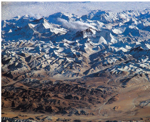
Natural terrain of shilajit

Wide controversies exist on the nature of Shilajit. It is considered to be both plant and mineral and it is only recently that chemical studies are being conducted on it. One view is that Shilajit is derived from vegetable sources, and the sap of the plants comes out as gummy substance from rocks due to heat.